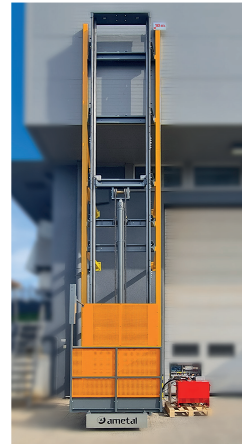
Hydraulic Goods lift with closed platform.